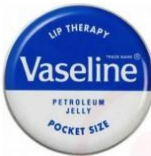
Lip Therapy Original

Persistent eczema around the lips may require the use of an anti-eczema ointment containing corticosteroids. These are prescribed by your GP or dermatologist. One example is hydrocortisone ointment. Do not use these types of ointments too often around the lips, as they can cause side effects. Keeping the area well moisturized is more important.