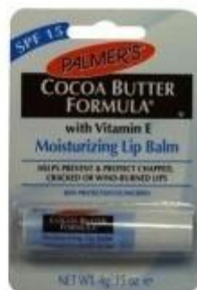
Palmers cocoa butter lipbalm 4 g