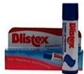
Blistex Classic Lip Protector Stick 4.25gr