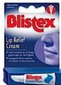
Blistex Lip Relief Cream tb 6gr